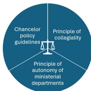
Three Governance principles of the Executive in Germany