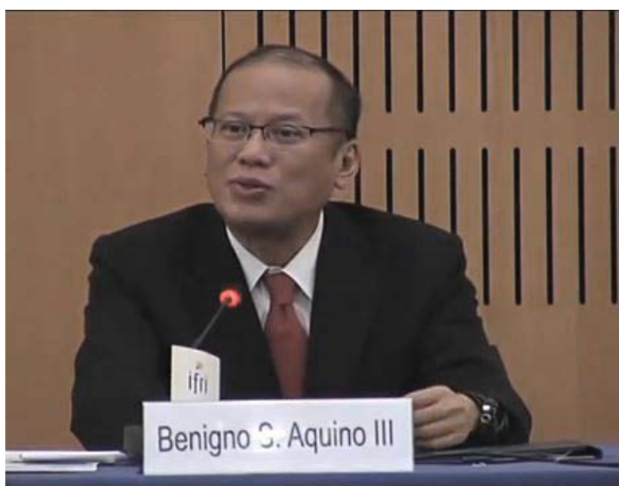
Benigno S. Aquino III, President of the Republic of the Philippines