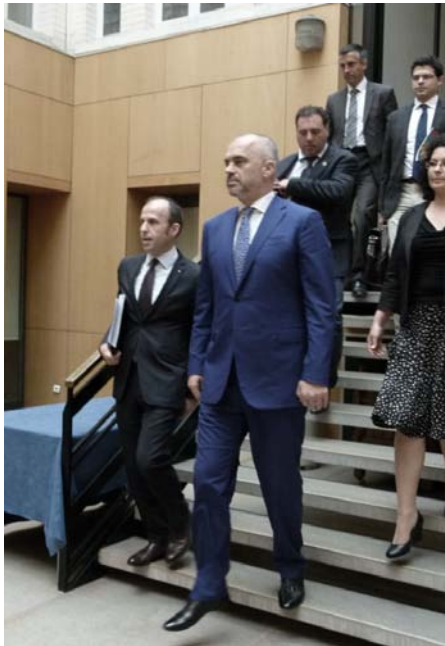
Edi Rama, Prime Minister of Albania