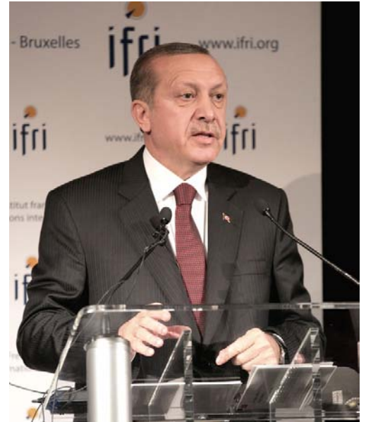
Recep Tayyip Erdogan, President of the Republic of Turkey