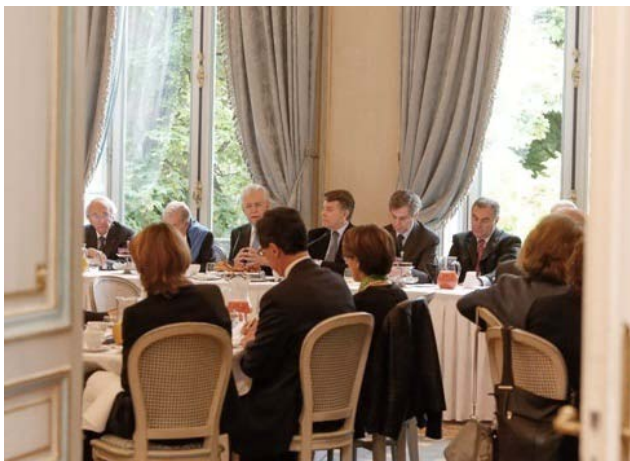
Breakfast debate with Mario Monti, former Italian Prime Minister

THERE ARE THREE MAIN WAYS TO SUPPORT IFRI: BY BECOMING AN IFRI MEMBER, SUPPORTING A PARTICULAR RESEARCH GROUP, OR BECOMING A MAJOR PARTNER AND SUPPORTING MULTIPLE RESEARCH PROGRAMS.