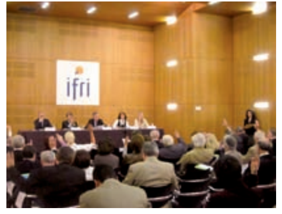
General assembly of Ifri. 2010

In 2010, for the fourth consecutive year, the French Institute of International Relations, Ifri, was the only French research institute placed among the first 50 most influential think tanks in the world (outside of the United States), and occupied the third place in Europe. This is according to a recent report, Global Go-To Think Tanks , from the University of Pennsylvania, which looks at 6,480 institutes located in some 169 countries.