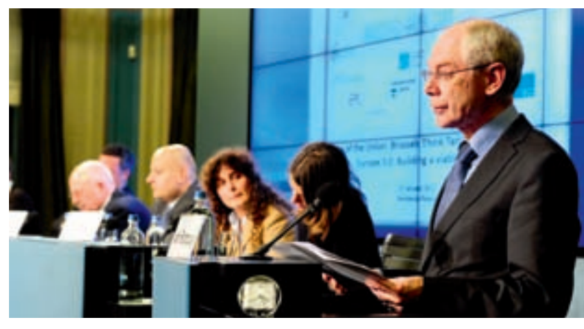
Herman Van Rompuy, President of the European Council, Think Tank Dialogue, Brussels

In 2010, the policy papers in this electronic collection were dedicated to Moldova, Serbia, and Kosovo; others were concerned with European defense, the economic crisis, and the European space strategy.