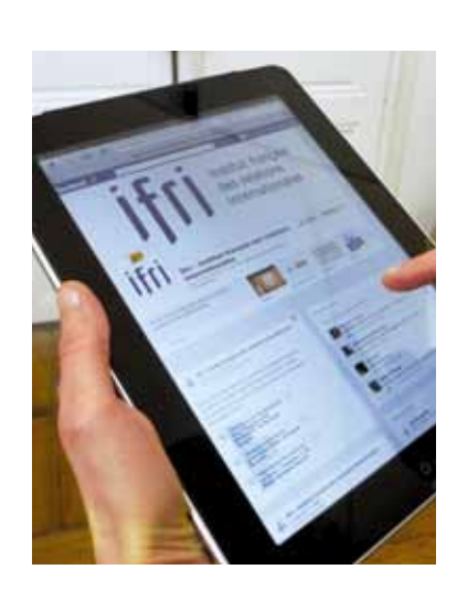
Media Relations Team:

Finally, Ifri has expanded its visibility in the blogosphere: Ultima Ratio , a blog written by Ifri's Security Studies Center, is now one of the leading blogs in France on defense issues. Ifri's renowned publication, Politique étrangère , also has its own blog, established on the occasion of its 75<sup>th</sup> anniversary.