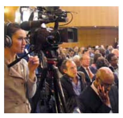
Ifri, conference room

In 2011, once again, Ifri was the only French research institute placed among the top 50 most influential think tanks in the world (outside of the United States), according to the Global Think Tank Report 2011 , published by the University of Pennsylvania.<sup>1</sup>