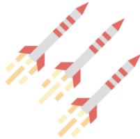
Conventional arms control